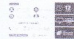
MMC Electronic CFN.png 4949K